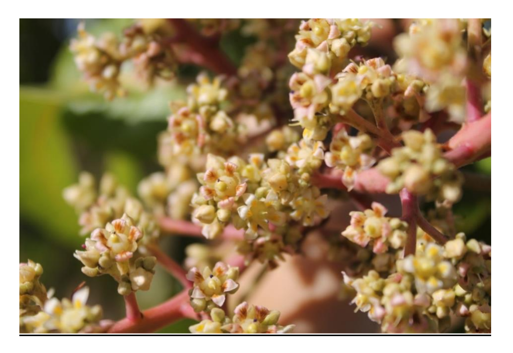
Figure 3. Mango flowers