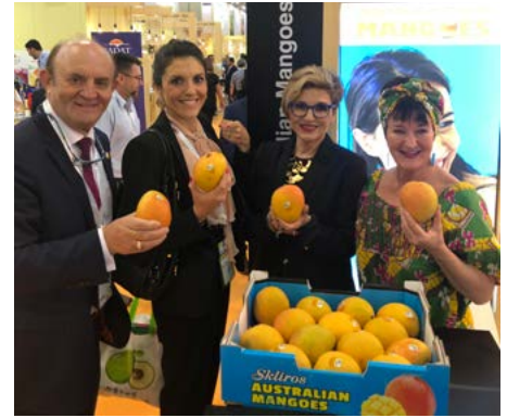
The visual beauty and aroma of Australian mangoes always brings a happy smile.