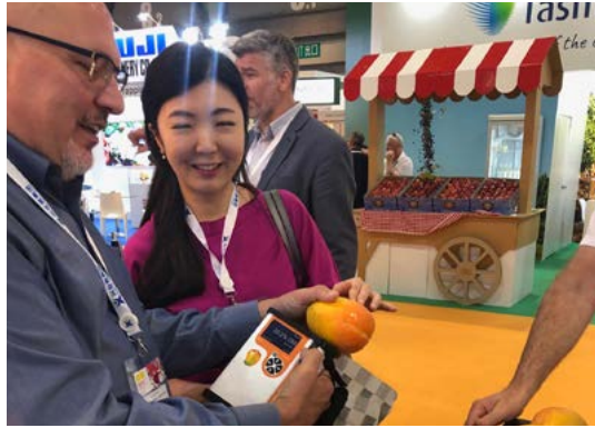
Felix Instruments demonstrates NIR technology.