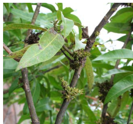
Mango malformation disease.

The symptoms of MMD on leaves and stems can look like the malformation caused by bud mites ( Aceria mangiferae ). However, unlike MMD, bud mites do not affect floral tissue and tend to impact older trees.