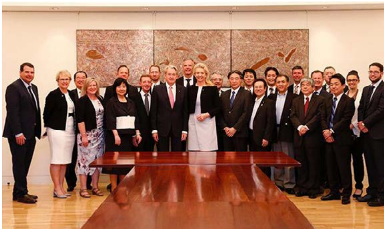
Attending dinner at the Australian Embassy in Tokyo, Japan.