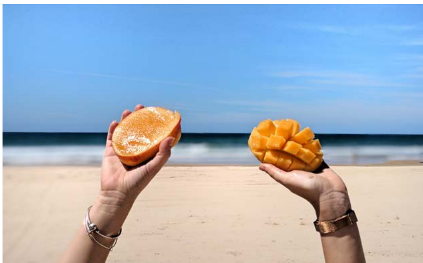
Our social media campaign will be 'always on' throughout the season.