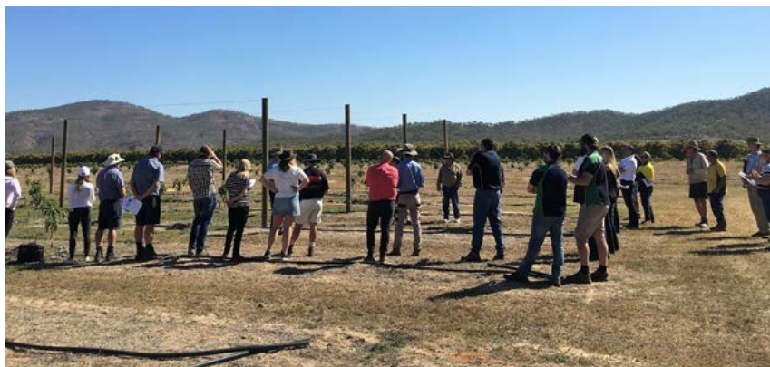
Industry stakeholders inspect the Mareeba Manbulloo trial site prior to the 2019 pre-season roadshow.