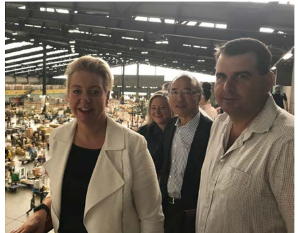
Touring the Ota Fruit and Vegetable Markets in Tokyo, Japan.