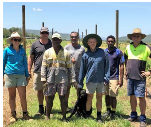
Manbulloo and DAF planting crew at the new Mareeba site.