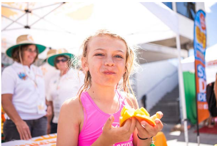
Mango Mess-tival will take place on Sunday, 1 December, this year.