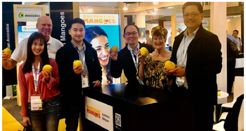
The team from AGRIFresh, Western Australia with the Australian Mangoes team.