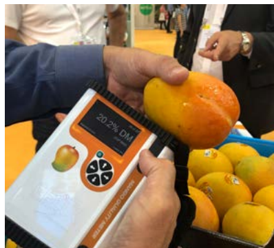
This sweet cheek gets a thumbs up for maturity.

Stakeholder aspirations and plans for the coming season were discussed and this content will inform our specific export activities, timing and budgets.