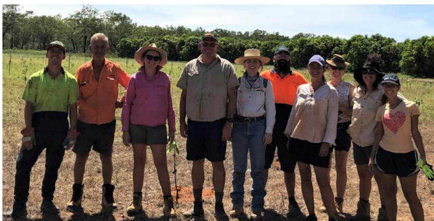
Katherine planting crew.

Two of these trials were established with Manbulloo Ltd, one of Australia's largest growers and exporters of KP and R2E2 mangoes, on their properties at Mareeba and Katherine.